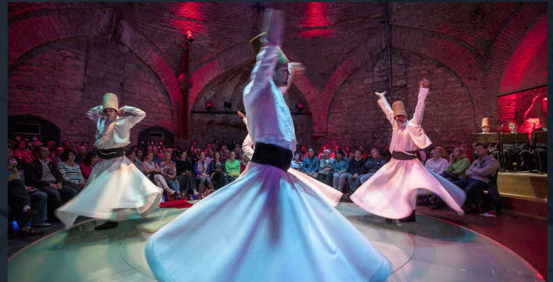
Whirling Dervishes Ceremony