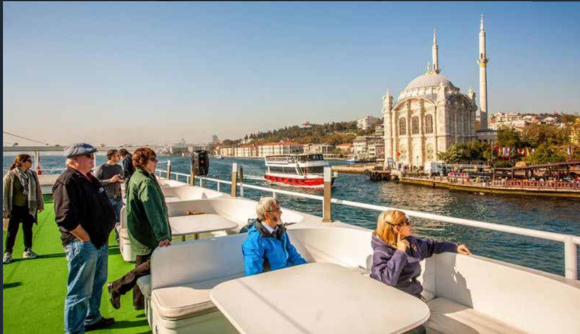
Bosphorus Tour with Saffet Tonguc